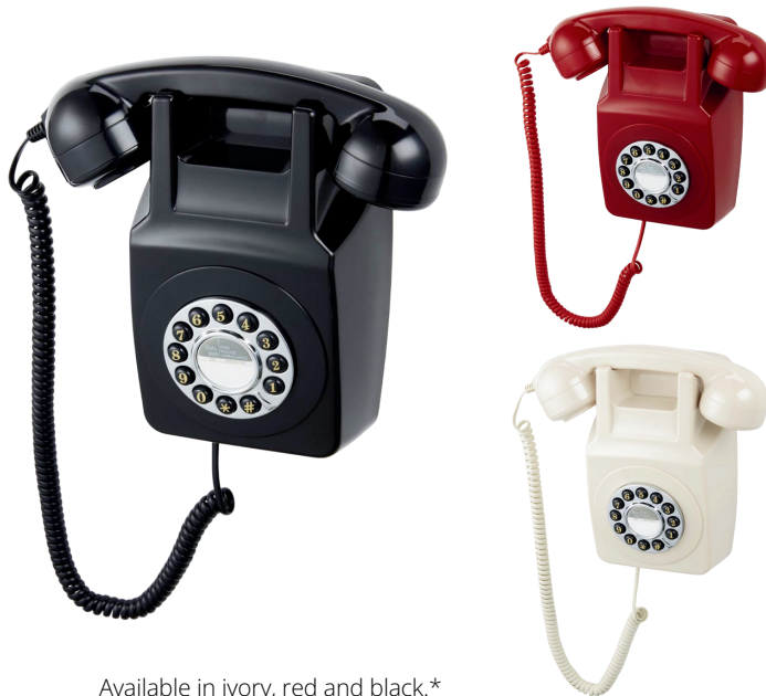
Available in ivory, red and black.*