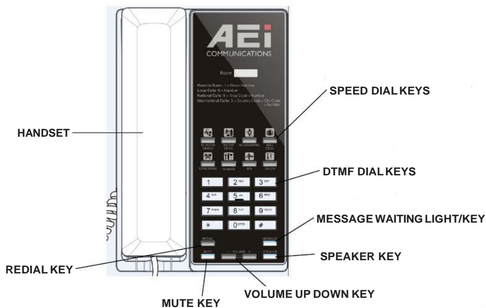
VM-6108-S DIAGRAM (FRONT)